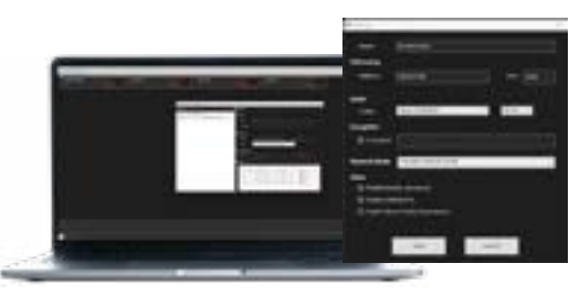
Windows App (Main, Talk Group Config)